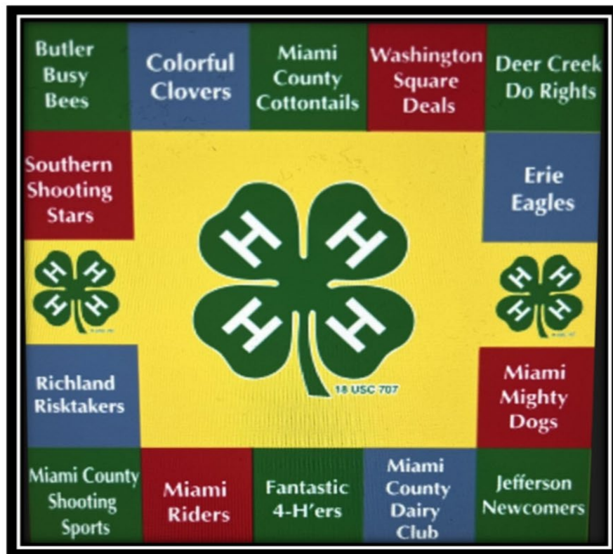
2024 T-Shirt Design by Chloe Carter