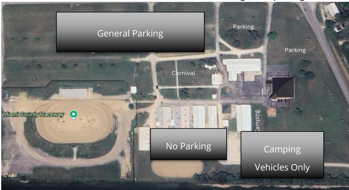
Livestock families may park by the livestock buildings for 15 minutes to load/unload or drop off feed.

Please pay attention to the Parking Map Below: Livestock families may unload feed/equipment on the south side of the livestock barns and then move their vehicles to general parking.